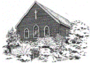
St Leonard's Church cnr Strickland & Mitchell Sts Denmark