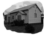
St. George's Church 11 Vista St Walpole

PO Box 277 Denmark WA 6333 www.denmarkanglican.org.au Email: denmarkanglican@gmail.com