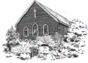
St Leonard's Church cnr Strickland & Mitchell Sts Denmark