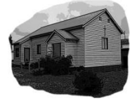
St. George's Church 11 Vista St Walpole

PO Box 277 Denmark WA 6333 www.denmarkanglican.org.au Email: denmarkanglican@gmail.com