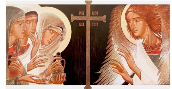
The Myrrhbearers Lyuba Yatskiv, Ukraine